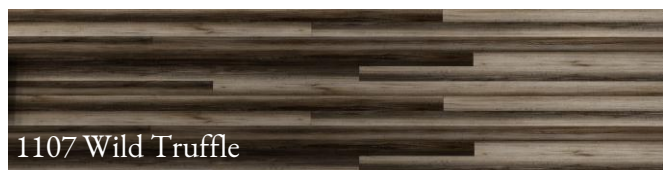
1107 Wild Truffle