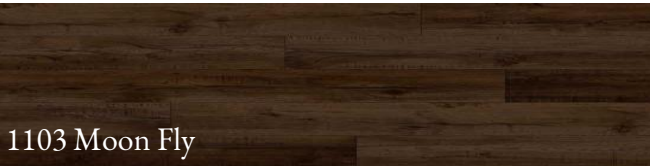
1103 Moon Fly