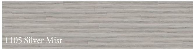
1105 Silver Mist