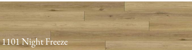
1101 Night Freeze

Crafted for both residential and light commercial spaces, our Vinyl 11 collection features a modern 9" wide plank design with enhanced thickness for added durability. Each plank includes a 2 mm underpad for superior performance across all installations. Available in a wide range of colors and made from safe, high-quality materials, this collection is a perfect choice for basements and light commercial use.