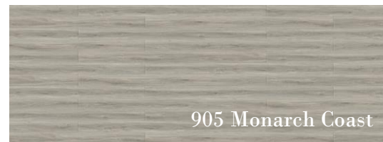
905 Monarch Coast