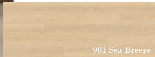
901 Sea Breeze