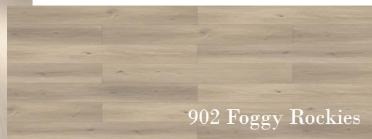
902 Foggy Rockies