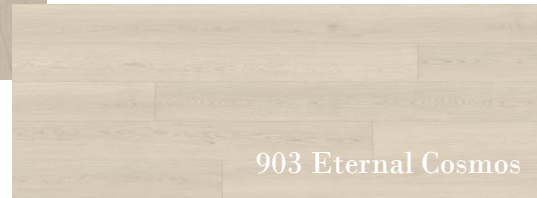
903 Eternal Cosmos